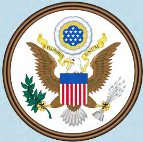
Foreign Corrupt Practices Act